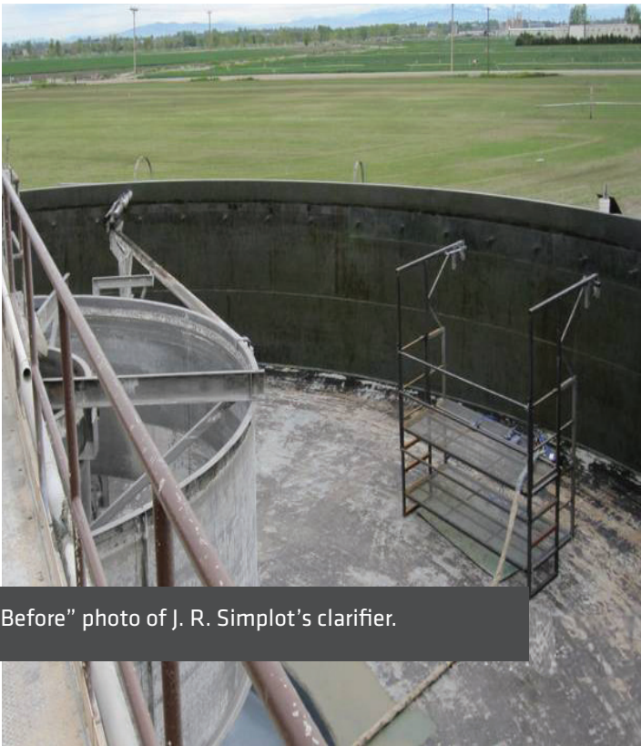
“Before” photo of J. R. Simplot’s clarifier.

vide a long lasting floor that withstands thermal shock. Additional areas within the plant were outfitted with Stonclad HT and incorporated textured aggregates into the top coat, resulting in a safe, slip resistant floor. The job was completed within the given time frame, and the newly installed Stonclad Xpress allowed for heavy forklift traffic the very next day.